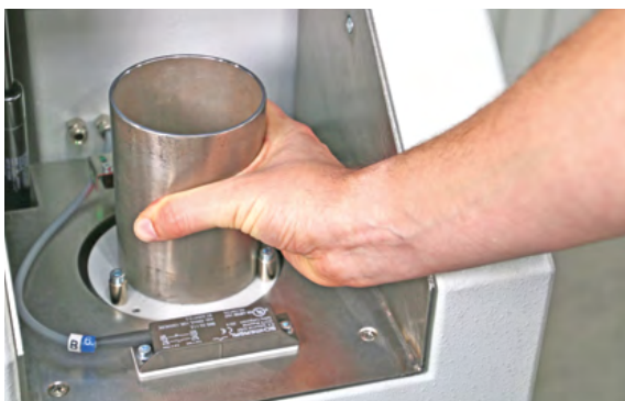
Separate output position for the sample cup

Great deal was set in user-friendly operation of the machine. The machine cover has an external and internal handle for easy opening and closing. Lifting and lowering of the cover is virtually effortless due to the support by gas pressured springs. With equal ease, the operator can lift the lid of the grinding vessel due to an integrated robust spring mechanism. This makes filling of the sample into the grinding vessel very simple for the laboratory personnel. After starting the program on the HMI panel the grinding vessel is locked by a pneumatic cylinder. After completion of the pulverizing process, the grinding vessel is automatically evacuated via the bottom valve. The ground material is filled into a sample cup which can be removed from a separate output position. In the meanwhile, the grinding vessel is automatically cleaned by compressed air to be ready for the next grinding action.