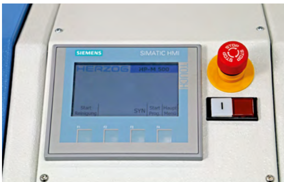
Easy program selection through the HMI control panel

The HP-M 500 is the disc grinding mill especially designed for pulverizing of large material volumes. The machine can be equipped with an exchangeable 500 or 1000 ccm grinding vessel made from chrome steel. The HP-M 500 enables automation of strenuous and time-consuming preparation steps including filling of ground material into the sample cup and cleaning of the grinding vessel. This significantly improves labor safety, lowers physical stress of the laboratory staff and increases reproducibility of sample preparation and analysis.