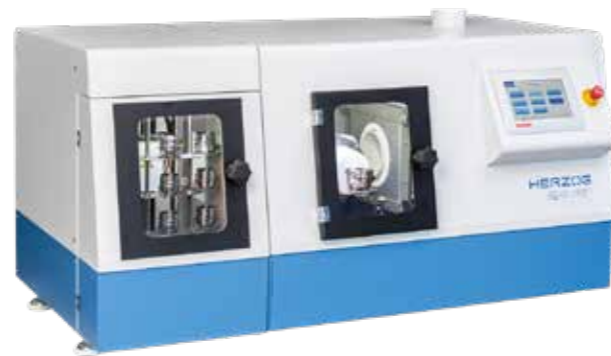
Bead One R with an automatic magazine for unmanned preparation of up to nine samples. The magazine can be added to the basic machine at any time.

The Bead One R combines highly repeatable and accurate analysis results with easy-to-use interfaces and maximum safety measures. Precisely controlled temperature and fusion parameters as well as the optional automatic magazine makes the Bead One R your future-proof instrument for analytical excellence.