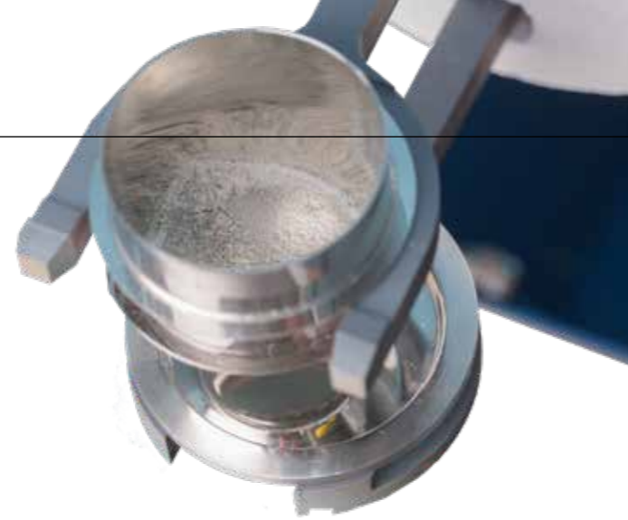
Precise sample preparation

The Bead One R combines ergonomic machine operation with highly precise sample preparation, ensuring repeatable and accurate analytical results. Designed for ease of use, its intuitive interface and automated handling system streamline workflows while reducing operator workload.