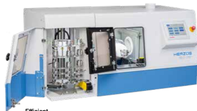
Efficient magazine management

The Bead One R magazine is designed for maximum safety. The safety door prevents operator's interference with the magazine handling device. The covered extra cooling position guarantees a cool-to-cool operation.