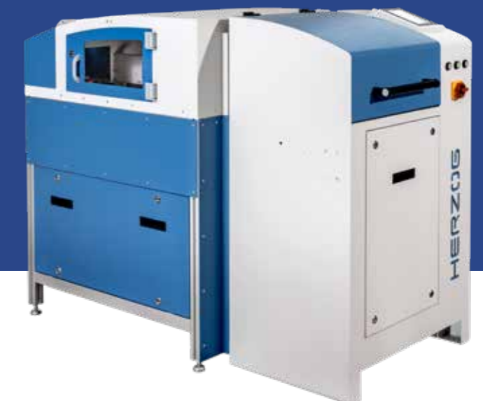
HP-PKM with magazine for automatic loading and unloading of grinding vessels

In addition, the generously dimensioned flaps of the HP-PKM facilitate access for maintenance and service work.